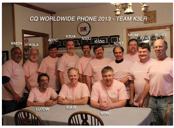
K3LR 2013 operating team.

with their teams and were great contesting mentors to me," he says.