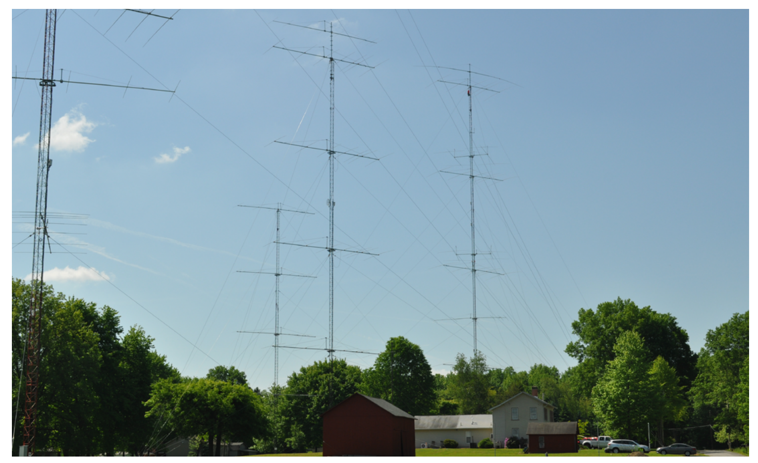
A partial picture of K3LR's antenna farm.