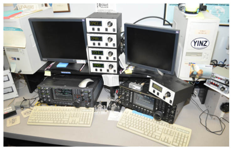
One of the operating positions, featuring a pair of Icom transceivers.

A lot of preparation goes into operating these contests each year. "We could be on the air in a contest every weekend, because the contest calendar is full of them—but we've traditionally concentrated on just the major DX contests: the CQ Worldwide CW and Phone, the ARRL International DX contest, which also includes CW and phone," he says. "Those four weekends it's guaranteed we'll be on the air in a competitive role. We're fully staffed with operators and we